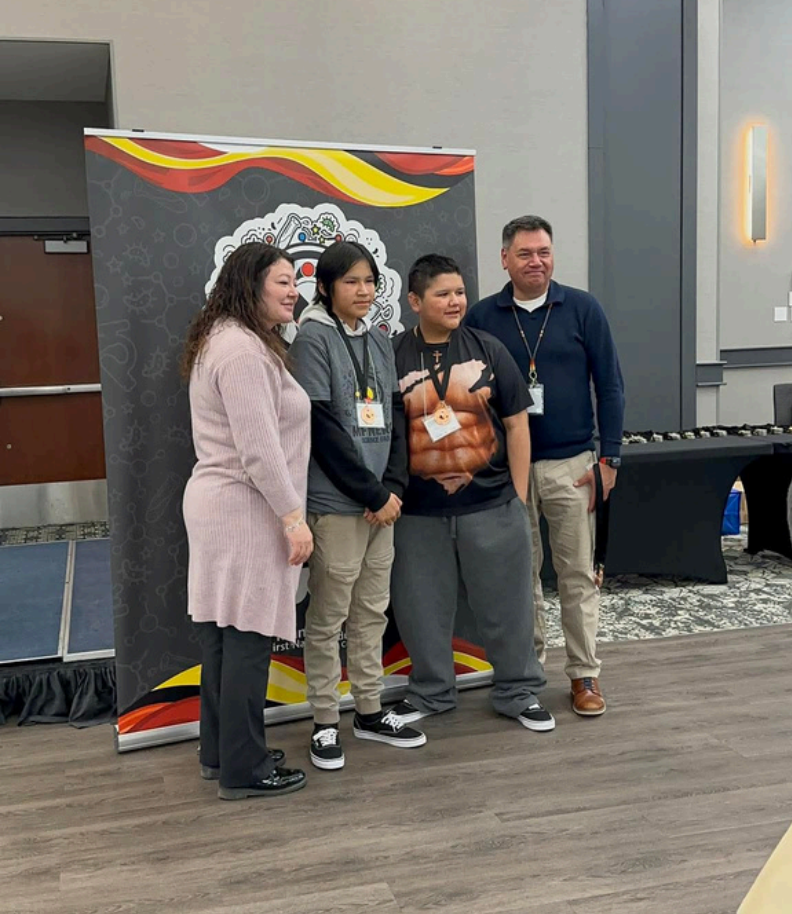
Keeping You in the Know, One Issue at a Time!